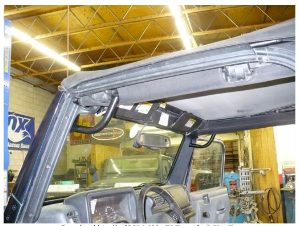
Completed install of PPM-5804 TJ Front Grab Handles

9) Installation is now complete; reinstall hard / soft top and all other factory parts removed during installation.