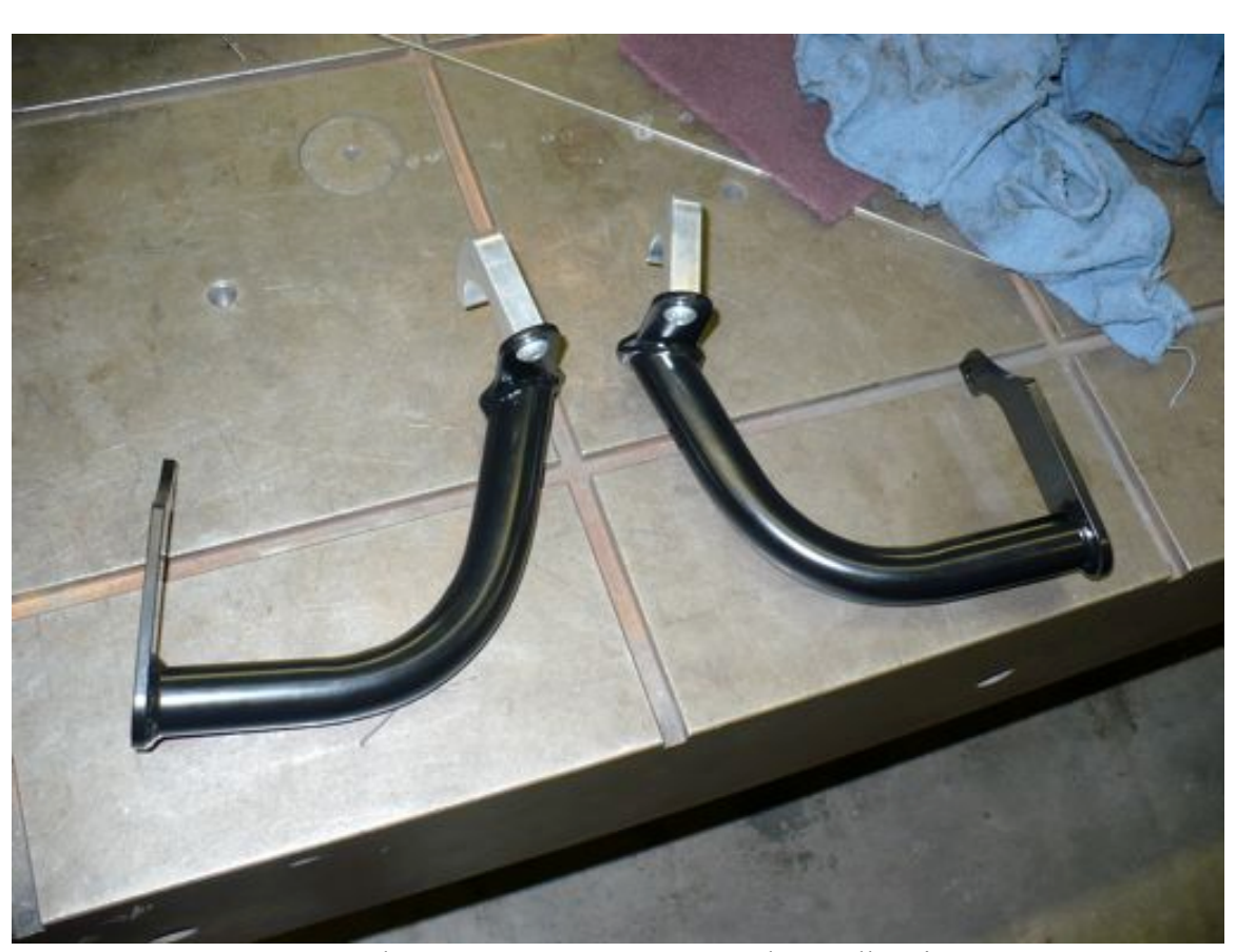
Complete PPM-5804 TJ Front Grab Handle Kit