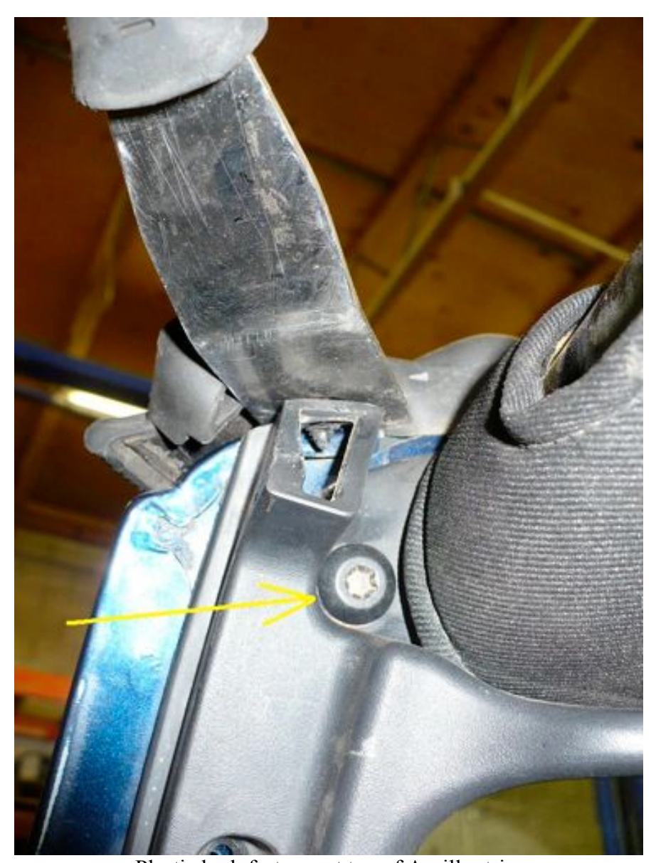
Plastic barb fastener at top of A-pillar trim